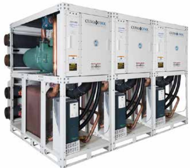
Three (3) 80 ton modules totaling 240 tons capacity. Modules are configurable up to 640 tons per bank.

Integrated CoolLogic Control System Infinite unloading and optimum part-load efficiency, incremental water flow and precise temperature control. BAS interface via native BACnet, LonWorks, Modbus and N2 communication which reduces overall building energy usage.